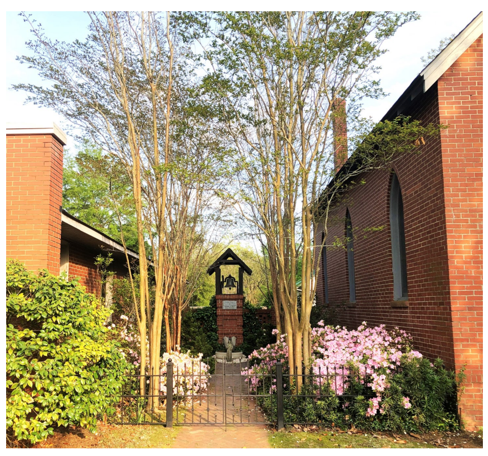
Take the time when passing by to look at our Memorial Garden — better yet, go inside and sit in the quiet beauty, perhaps meditate and offer a prayer in thanksgiving for the beauty of God's Creation.