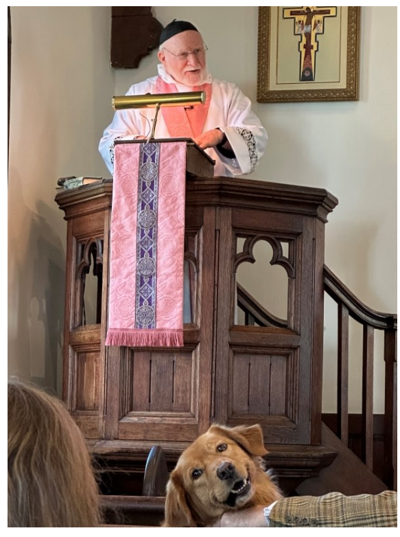
Tucker the Support Dog makes sure everyone is paying attention to the sermon.

Please make note as the old address will no longer be good after Easter.